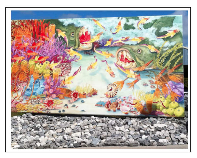
The mural at the Besser Museum Fossil Park by Judith Dawley

You can take as much as you want, and the fossils are abundant and well preserved. Here you can find stromatolites, corals, bryozoans, trilobites, gastropods, and crinoids. You will need a hammer, chisel, bucket/ container, packing material, knee pads, glue mixture, a dental pick, a tool box for holding it all, and a coat if the weather is bad. If you are willing to pay for access to a second similar arrangement behind the museum, the material is less picked over. Also, the museum is very well done and has several interesting exhibits on the history of the Alpena area.